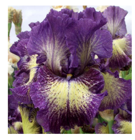
'Foolish Dreamer' (Keppel, 2011) One of the many beautiful irises available at this year's auction See pictures starting on page 4