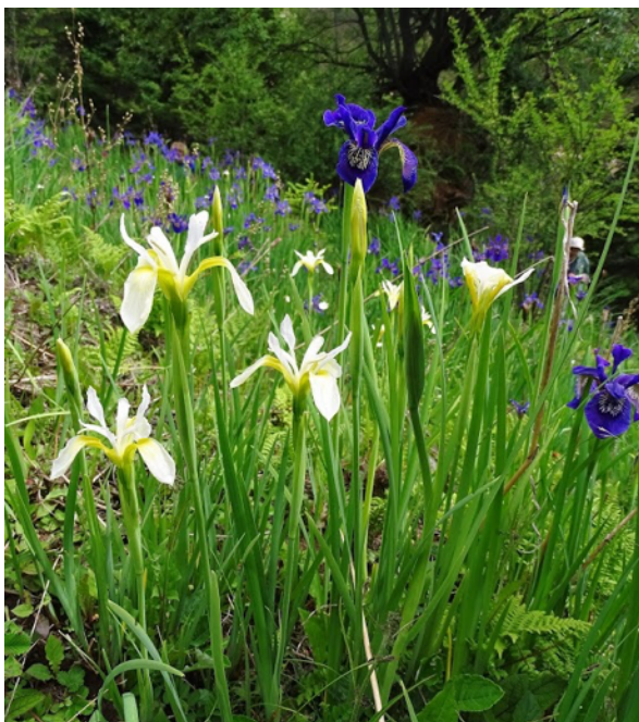
Iris bulleyana albino