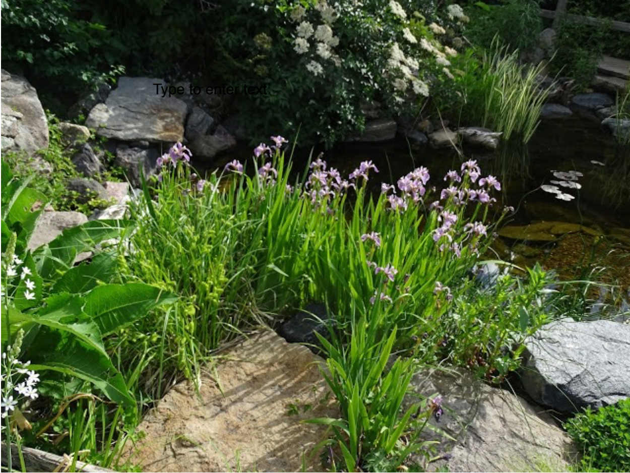
Iris versicolor in full bloom