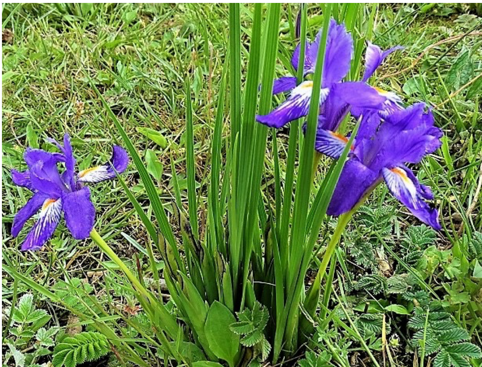
Iris dolichosiphon is in the Pseudo-Regelia section of the genus--which means it's much more closely related to bearded iris and that it is in fact an Aril iris.