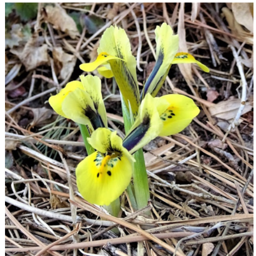
Iris x reticulata 'Orange Glow'