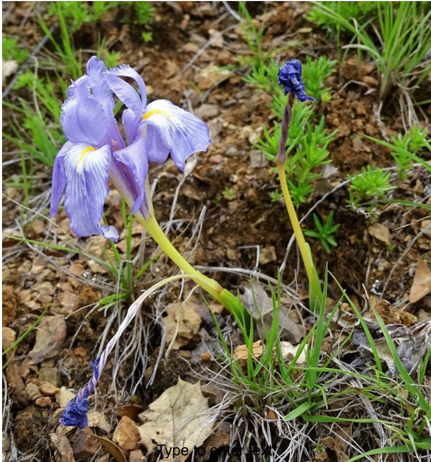
Iris dolichosiphon This one has the mottling so characteristic of other Pseudoregelia irises.