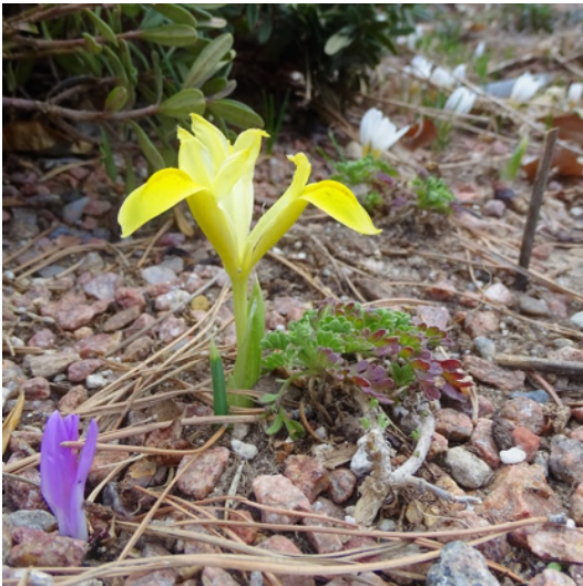
Iris x reticulata 'Sunshine'