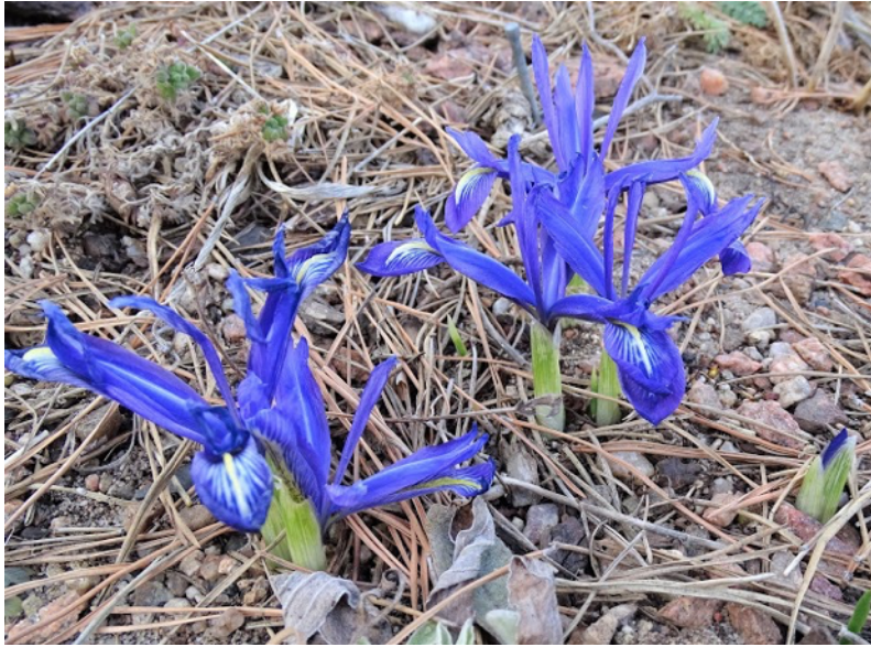
Iris histrioides v. Sophenensis