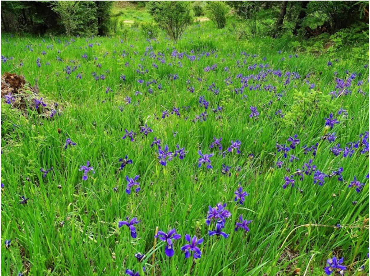
Field of Iris missouriensis forming an azure pool of color along the Colorado in Middle Park.