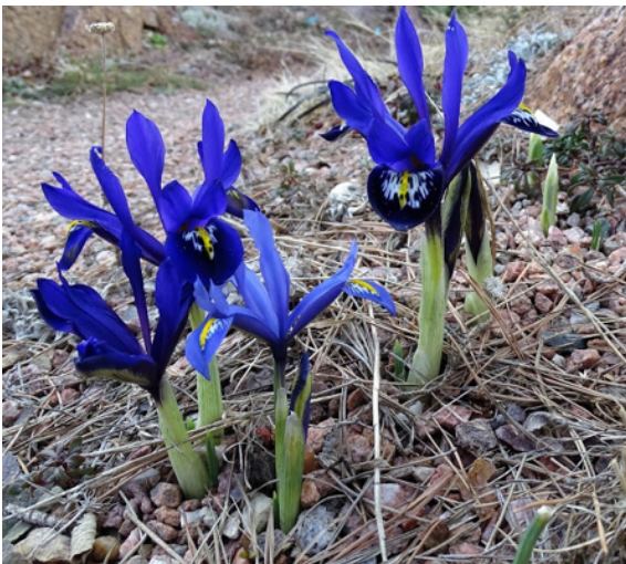
Iris x reticulata 'Palm Springs'