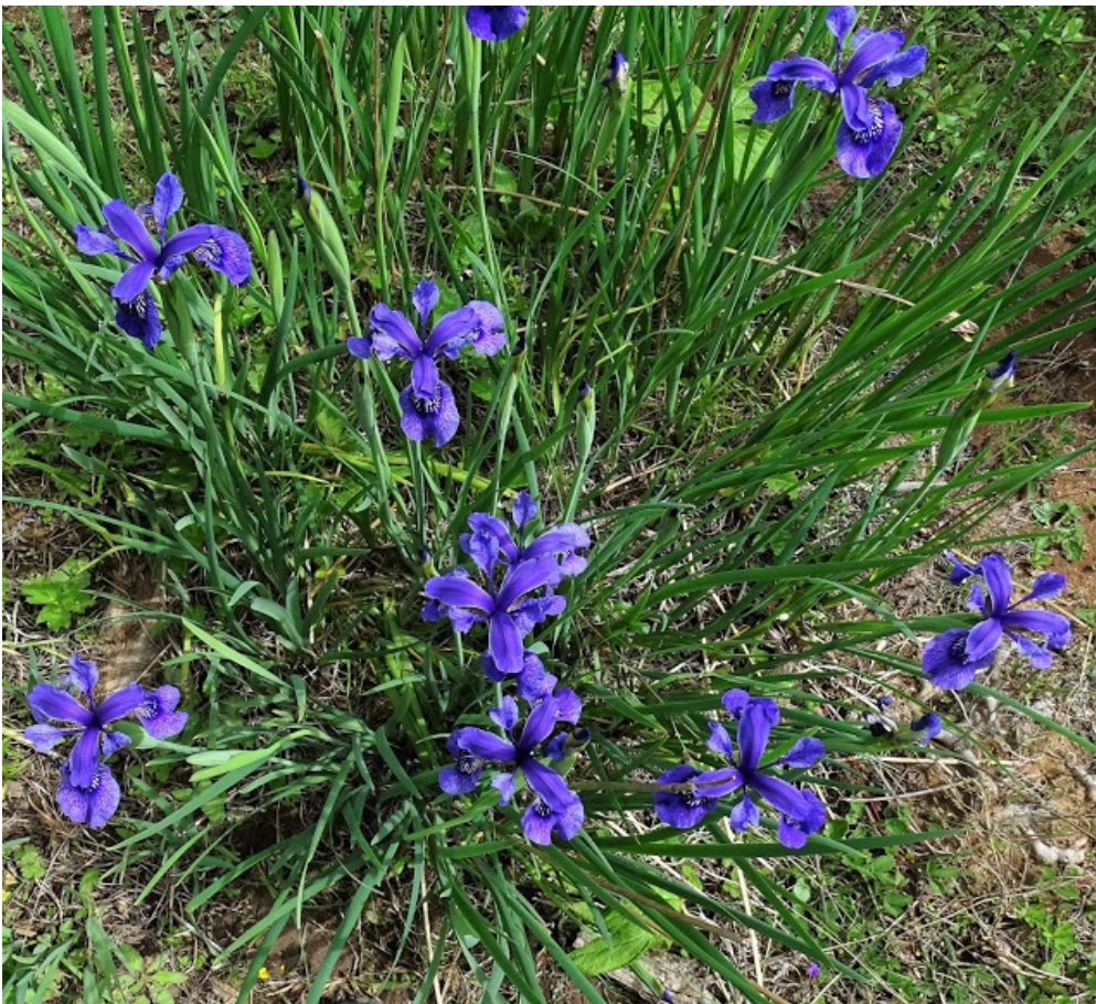
Iris bulleyana growing in the midst of a second growth forest