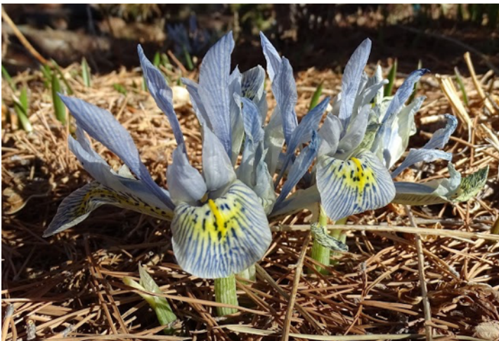
Iris x histrioides 'Kanharine Hodgkin'