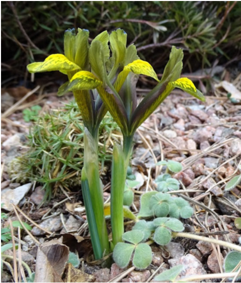
Iris x reticulata 'Mar's Landing'