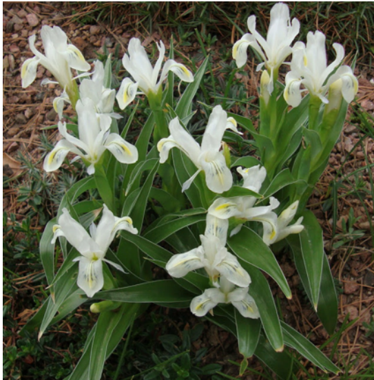
Iris bucharica ( wilmottiana ?) 'Alba'