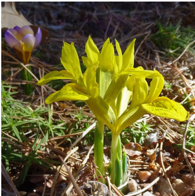
Iris danfordiae hybrid un-named