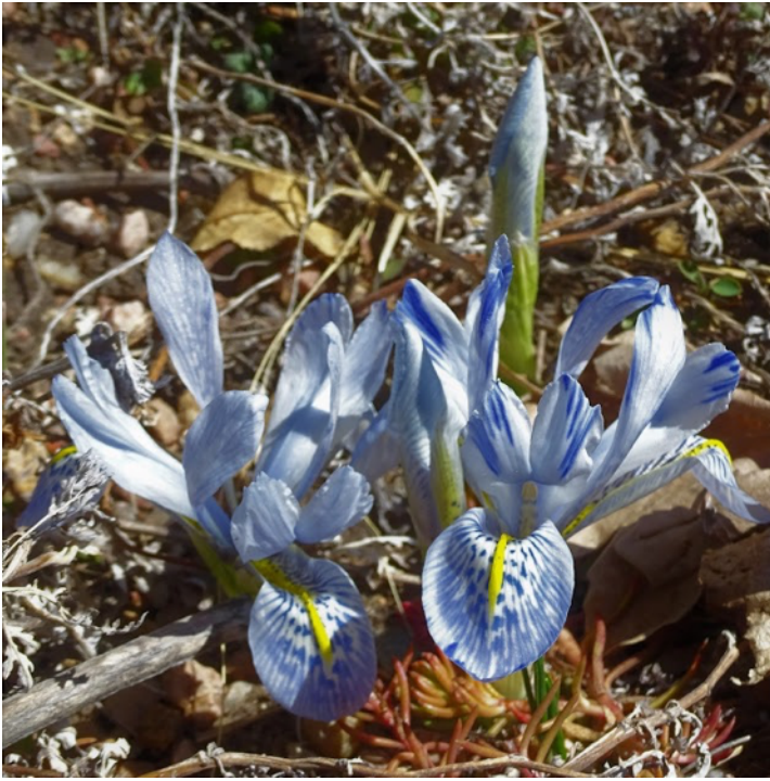
Iris x histrioides ' Sheila Ann Germaney'