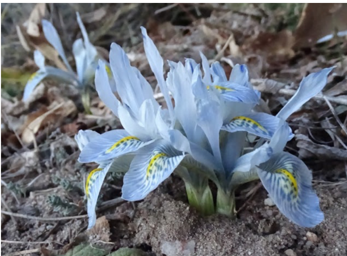
Iris x histrioides 'Frank Elder'