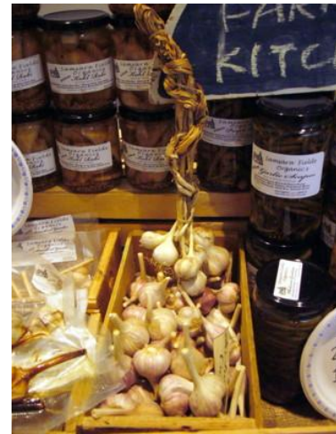
Farmer's Market with lots of organic food