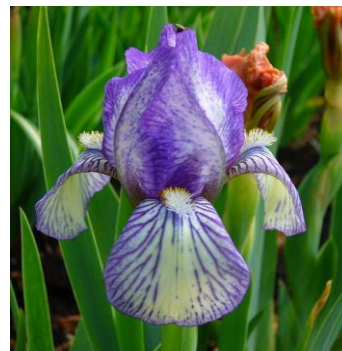
‘Mini Plic’ (Brown, 1969)

As one of the earliest plicata MDBs this is a distinctive little iris; a good one for rock gardens.