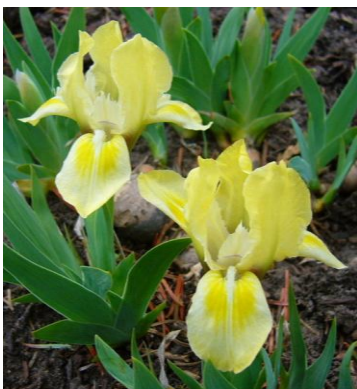
‘Compact Buddy’ (L. Miller, 1997)

This is a dainty, deep burgundy iris with bushy gold beards and slight ruffling. In my mind, the picture says it all.