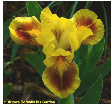
‘Hot Babe’ (Spoon, 2004)

This is one of the last MDBs to bloom in my garden. It has slight ruffling and a standout maroon fall spot.