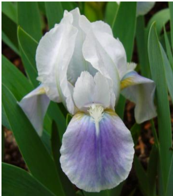
‘Alpine Lake’ (Willott, 1981)

Since Miniature Dwarf Bearded irises (MDB) are the first bearded irises to bloom in the spring I thought I would provide a list of my favourites. These irises grow up to 8” tall. Because of their size they are perfect for rock gardens or the front of a bed. They also perform extremely well in our cold climate. In fact they perform so well it was hard to limit myself to just a few.