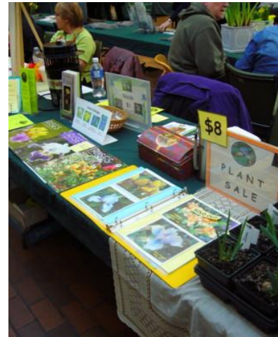
Offerings at the ONIS Table