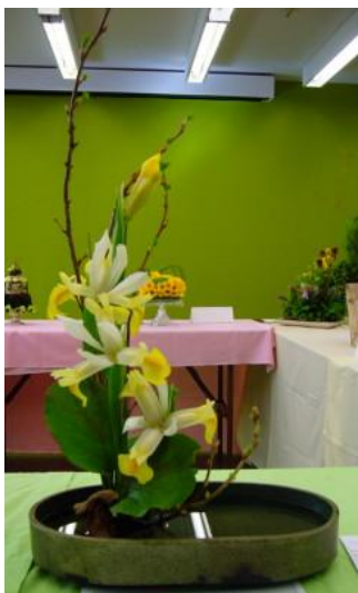
Spuria Iris Flower Display Wins Best in Show!