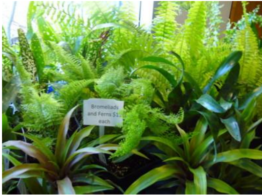
Lots of plants and blooms to admire.

Seems Warton Willy knew what he was doing when he predicted an early spring! At almost 12°C it certainly felt like Spring had actually sprung. The warm, sunny weather was cheerfully welcomed as visitors came out to the TBG. Thanks to all the ONIS members who stopped by to say 'hello'!