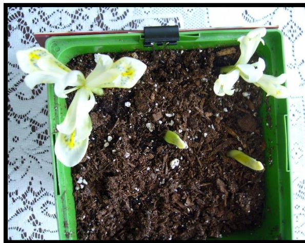
'Katharine's Gold' in bloom!

them a quarter turn every day however it was more like every three days. Anyway, I dashed down the stairs to find 'Katharine's Gold' in full bloom! It seems she was just a slow starter. At this point she was well ahead of the other two pots which were still developing.