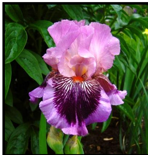
TB 'Plum Pretty Whiskers'