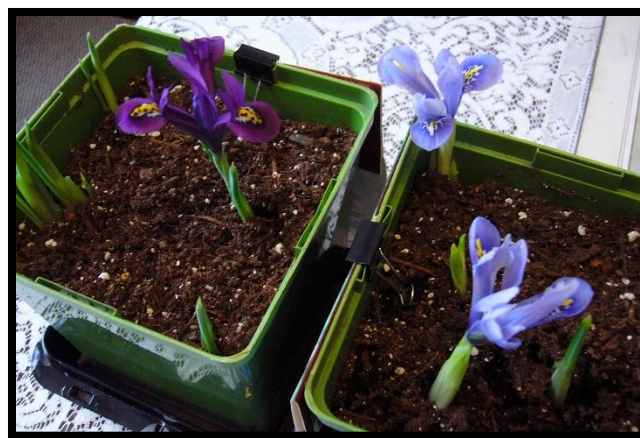
'J.S. Dyt' and 'Alida' in bloom.

In the days that followed our dining room table was graced with colourful blooms of reticulatas. Just as 'Katharine's Gold' started to fade, 'J.S. Dyt' came into bloom. A few days after that 'Alida' bloomed. This resulted in about two weeks of bloom...and I admired those blooms each and every day!