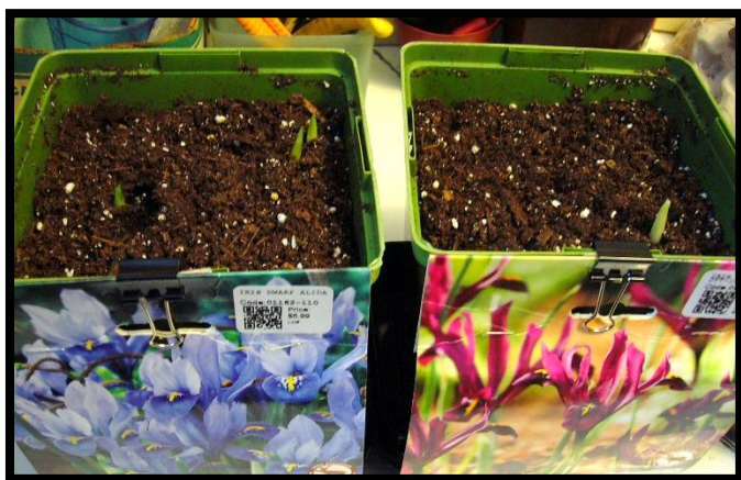
Squint, and you can see 'Alida' and 'J.S. Dyt' sprouting!

Within six days little shoots of green were poking through the soil in two of the pots. I was ecstatic! One cultivar, 'Katharine's Gold', wasn't showing any signs of life. This didn't surprise me as the bulbs were fairly dried out when they were planted. But I still had two pots that showed promise!