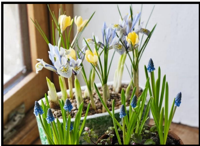
Iris reticulata 'Katharine Hodgkin', Crocus chrysanthus 'Romance', Muscari armeniacum and Anemone blanda 'Charmer'