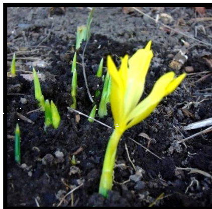
Iris reticulata 'Sunshine' in bloom on February 20, 2023.

Due to the unseasonably warm winter, our reticulatas started to poke their wee heads out of the ground in late January. When the snow finally fell in February, I knew these tough little bulbs could take it. But the snow didn't stick around for long and in February 'Sunshine' was in bloom in the garden...three weeks earlier than last year!