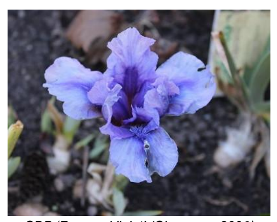
SDB 'Forever Violet' (Chapman, 2000)

But that's not the end of this reblooming story! Despite snow and freezing temperatures, Sky Willow (D. Spoon, 2005) continued to grow. By the end of November there were six developing bloom stalks. On December 2, I brought five of them