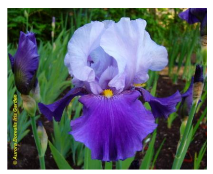
'Twilight Fancies' (Zurbrigg, 2001)

If any of these irises are of interest to you, some of them will be available at the ONIS Auction and Sale in August.