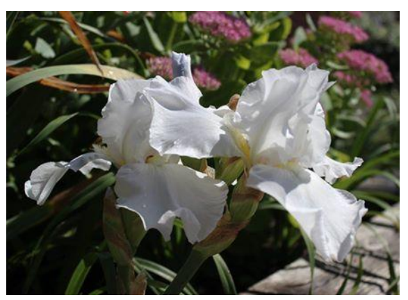
TB 'Immortality' (Zurbrigg, 1982)

Zurbrigg's 'Immortality' rebloomed for several members as well as MDB 'Forever Violet' (Chapman, 2002) and SDB 'Autumn Jester' (Chapman, 2000)