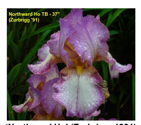
'Northward Ho' (Zurbrigg, 1991)