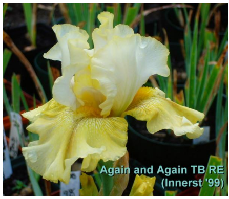
'Again and Again' (Innerst, 1999)