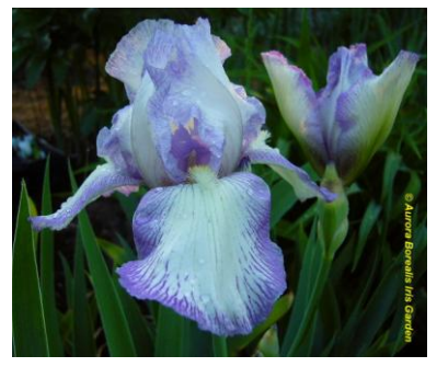
'Queen Dorothy' (Hall, 1984)