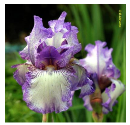
'Earl of Essex' (Zurbrigg, 1979)