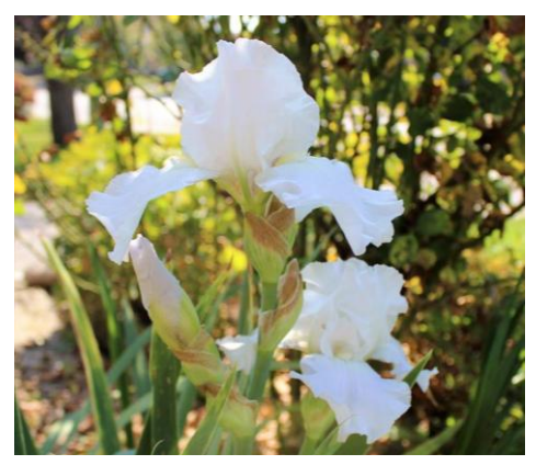
'Immortality'